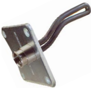
PLATE TYPE HEATERS