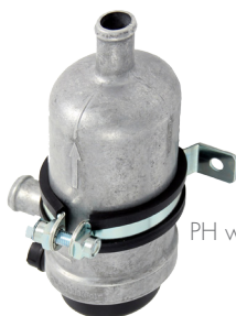
PH with bracket PH Pro

All PH have 20 mm diameter connection tube. The PH can be delivered either as a complete kit with heater and original bracket, cables, etc. or with just a heater and the original bracket. Bracket PH Pro to be ordered separately.