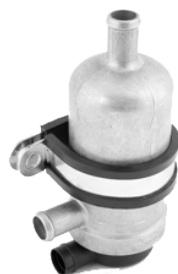
PH with original bracket